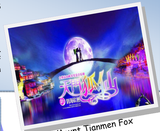
Mount Tianmen Fox Fairy Show