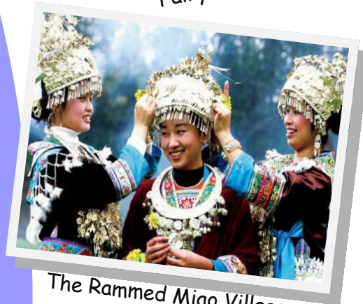
The Rammed Miao Village