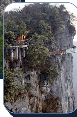
Tianmen Mountain Glass Plank