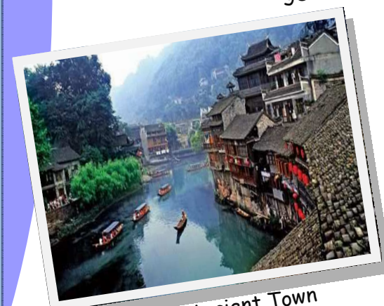
Phoenix Ancient Town