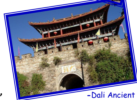
-Dali Ancient Town